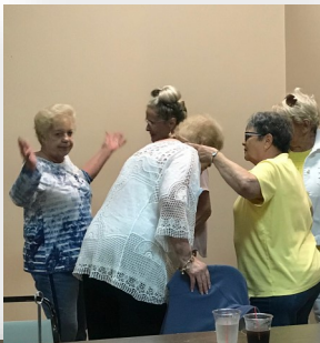
Class of 1959 Reunion